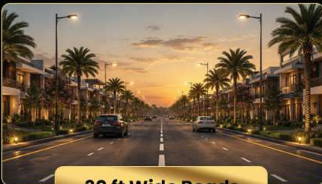
30 ft Wide Roads

With its outstanding design and amenities, SAMAR HOMES is a highly sought-after project, promising comfort, convenience, and a truly exceptional living experience for everyone.